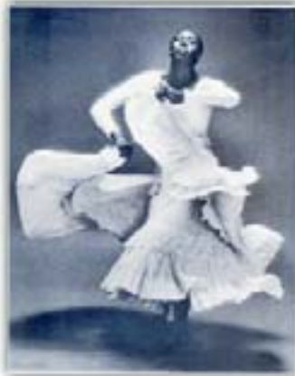
Judith Jamison dancing in Cry , 1976.

No one who ever saw Judith Jamison in performance can forget the tall, lithe figure, with arms seemingly extending into outer space, who brought significant recognition to dance as performed by African Americans. As a dancer for the globally acclaimed Alvin Ailey American Dance Theater from 1965 to 1980, Jamison performed landmark pieces — such as the anguished Cry and the exultant Revelations — that invariably brought audiences to their feet. Her years on stage with the Ailey company laid the foundation for her second career; since 1989, she has been a choreographer and artistic director of the Alvin Ailey American Dance Theater in New York City.